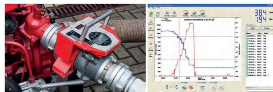
• Measurement and storage of flow rate and pressure. • PC display / Report.

We gave the Flowmaster a particularly rugged design for rough daily work: The stable measuring tube does without moving parts, the extremely resistant aluminium housing withstands the heaviest of loads whilst being light at the same time. The rechargeable battery allows the Flowmaster to work completely independently for 6 hours, and the integrated data logger with scan rates from 0.1 seconds to 1 minute automatically stores all data to memory.