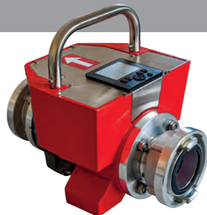
• Art.-No. 187387 Flowmaster DIGITAL 2.0.

We gave the Flowmaster a particularly rugged design for rough daily work: The stable measuring tube does without moving parts, the extremely resistant aluminium housing withstands the heaviest of loads whilst being light at the same time. The rechargeable battery allows the Flowmaster to work completely independently for 6 hours, and the integrated data logger with scan rates from 0.1 seconds to 1 minute automatically stores all data to memory.